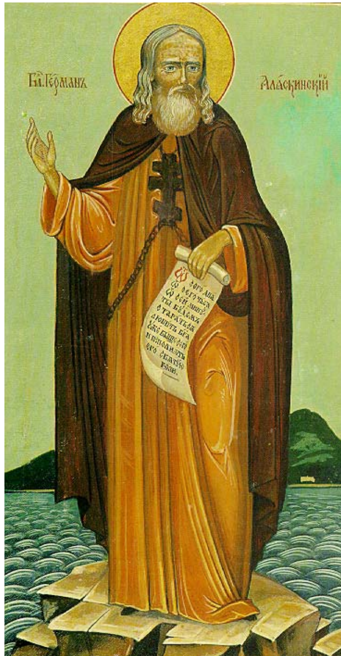
SAINТ HERMAN OF ALASKA