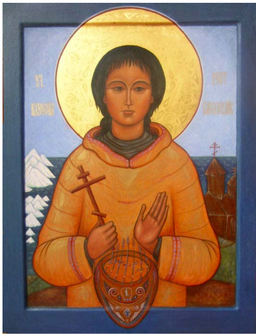
SAINT PETER THE ALEUT

to all. ⲡⲓ Glo-ry to Him that hath glo - ri - fied thee. ⲁ Glo - ry to Him that hath crowned thee. ⲁ (Δ) (□) Glo - ry to Him that work - eth heal-ings for all through thee. ⲡⲓ