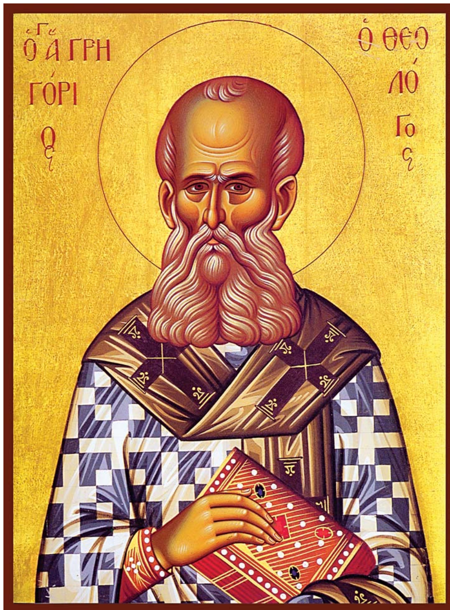
SAINT GREGORY THE THEOLOGIAN